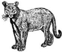
Puma (4 or 5 ft. long, not including the tail)

They live in North, Central, and South America.