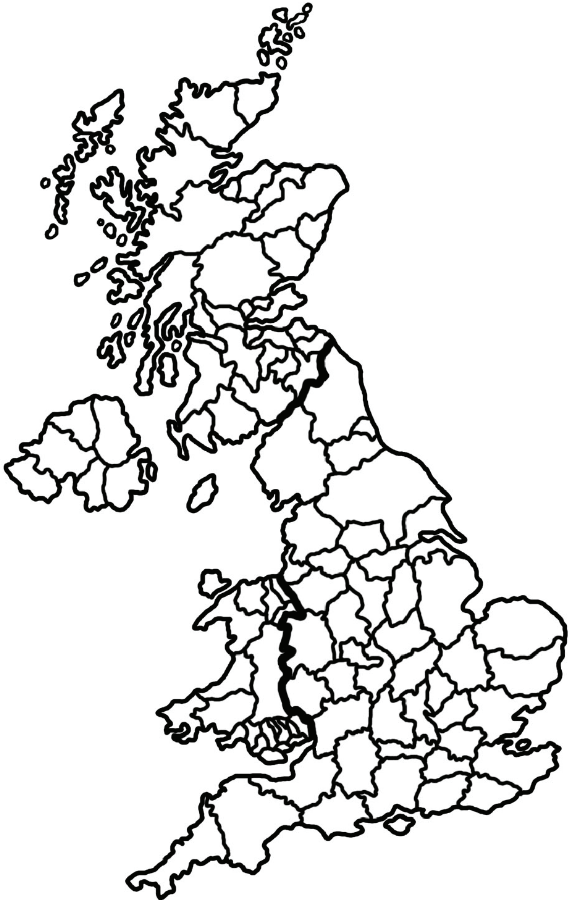
United Kingdom (including counties)