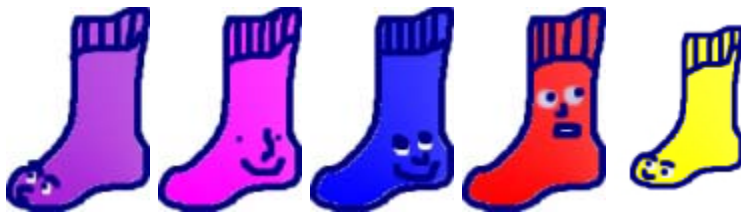
Purple Pink Blue Red Yellow

She had one purple sock, one pink sock, one blue sock, one red sock and one yellow sock.